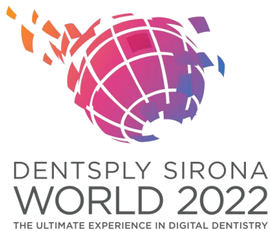
Fig. 1: DS World 2022 was held from September 15th to 17th at Caesars Forum in Las Vegas, NV.