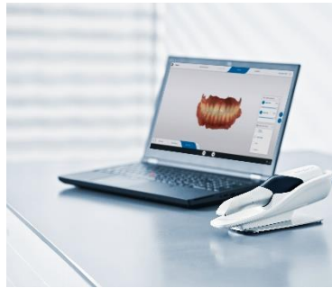
Fig 2: Primescan Connect